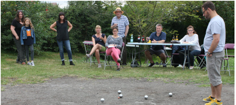
Boules at the Village Hall this July 16th

If you are keen to help - likely to be some painting work, maintenance of guttering, cleaning and clearing up in the kitchen and bar areas, tidying up outside the hall - you will be very welcome. Just come on down or speak to a committee member. We will aim to start at 10am.