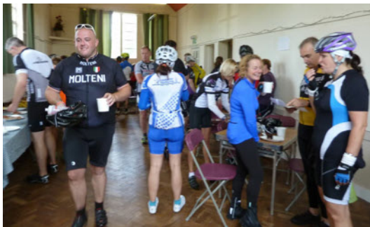
Shakespeare Bike Ride stopping in at the Village Hall in 2014

If anyone can help man the feed station on Sunday morning from 9.45am to midday or can provide a cake please contact Tricia Harbour on 680676 or Karen Barker on 680033.